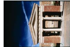
Providence, Rhode Island Founded 1914

Johnson & Wales University (JWU), founded in 1914, is a nonprofit, private institution. A recognized leader in career education, we offer accredited degrees in business, hospitality, culinary arts, technology and education to more than 16,000 graduate and undergraduate students, representing all 50 states and 96 countries. By integrating academics and professional skills, related work experiences, leadership opportunities and career services, JWU prepares driven students who are seeking a competitive advantage in the global economy. Our 80,000 alumni from 140 countries pursue careers around the world. The university is committed to urban revitalization and thoughtful historic renovation. Through active civic participation and unique learning opportunities, JWU improves the quality of life in its campus communities in Providence, R.I.; North Miami, Fla.; Denver, Colo.; and Charlotte, N.C.