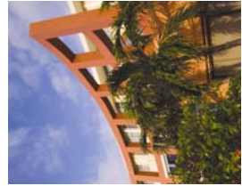
North Miami, Florida Founded 1992