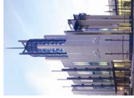
Charlotte, North Carolina Founded 2004

The Warwick RI hotel offers 111 spacious, renovated guest rooms and suites adjacent to T.F. Green International Airport and minutes from downtown Providence. Enjoy breakfast, lunch, dinner or cocktails and appetizers in our full-service, on-site Libations Restaurant and Lounge. 24-hour airport shuttle, guaranteed late check-out and a full-service Starbucks® coffee counter. Our guests can also enjoy an on-site, state-of-the-art Fitness Center. Additional amenities include complimentary high-speed Internet access, and a Business Center.